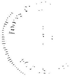
Kell Palguta, Mayor